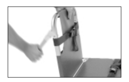
At the seat back are handles that will flip out to open for transporting patients and fold down for storage.