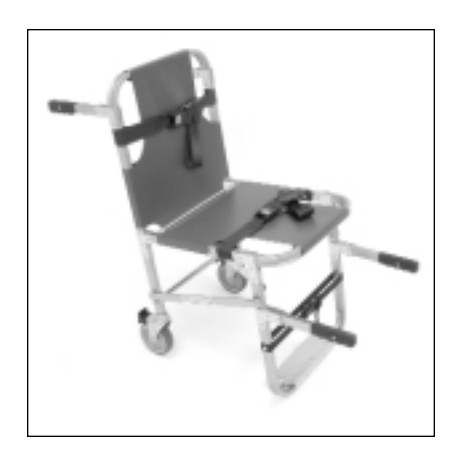
JSA-800W Wheels on front also with leg restraints.